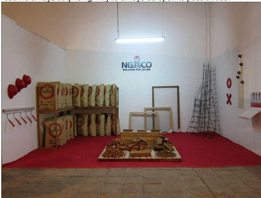
NGACO : Solution for nation, exhibition view

Many people think I'm a material-based artist, but I usually start with an idea of what I want to do. Then I find the suitable medium for it. Sometimes though I might take the opposite approach, where I don't have any concept. I know that's not good in contemporary art, where you should always have a statement. However, I sometimes want to get out of my comfort zone and allow myself to be guided by the material. The result is always surprising. I try to always be open to possibilities.